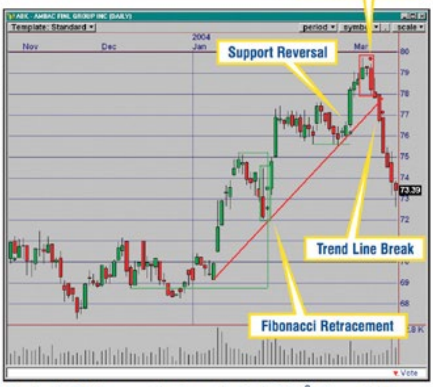
This chart for ABK shows several key Patterns identified by CPRM<sup>2</sup>. Often, multiple Patterns will fire in rapid succession, such as the Reversal Candle and Trend Line Break that occurred in March. When these Patterns occur with an OmniTrader Signal, the highest level of confirmation is achieved.

fueling the move in the direction of the reversal.